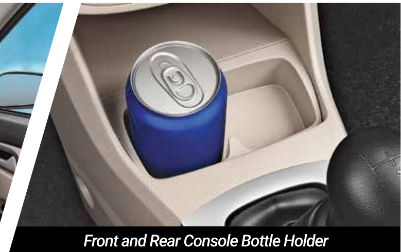
Front and Rear Console Bottle Holder