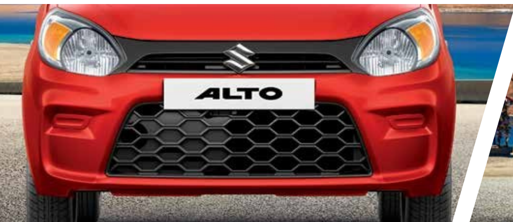
Dynamic New Aero Edge Design

The elegant new design lends a fresh appeal to the Alto, while also accentuating its distinct looks.