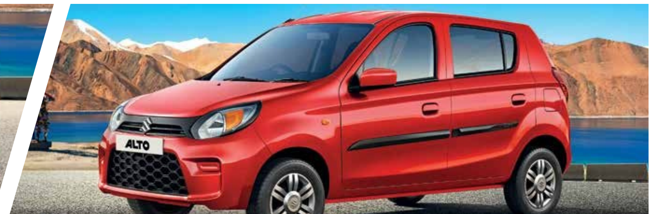
Bumper and Side Fender