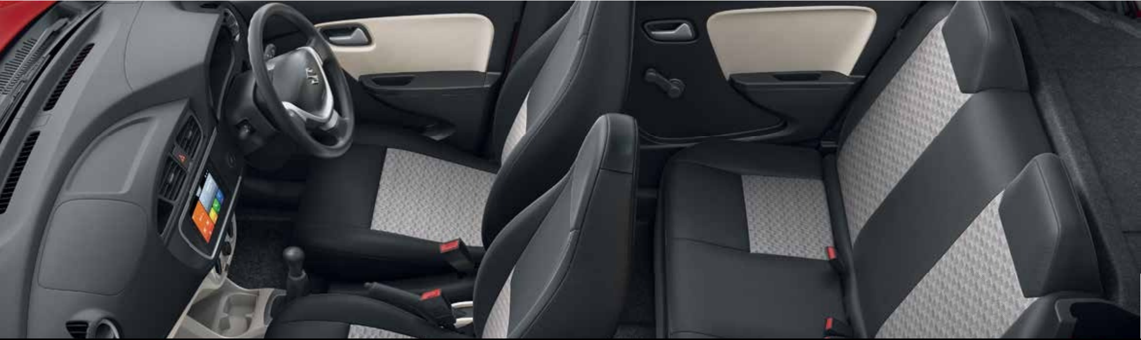
Stylish Dual Tone Interiors

A perfect blend of style and practicality, new Alto's upgraded interiors make it a universal favourite.