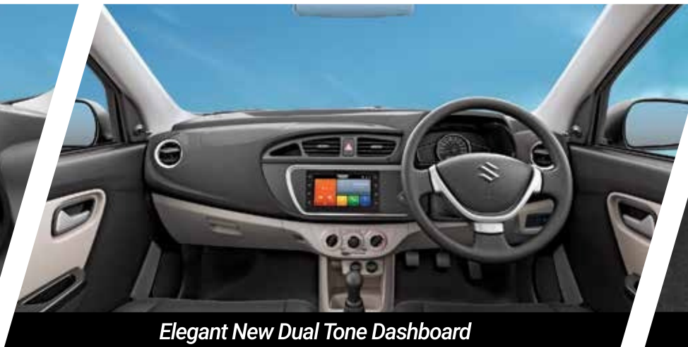
Elegant New Dual Tone Dashboard