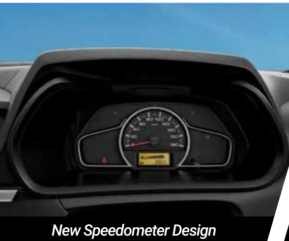
New Speedometer Design