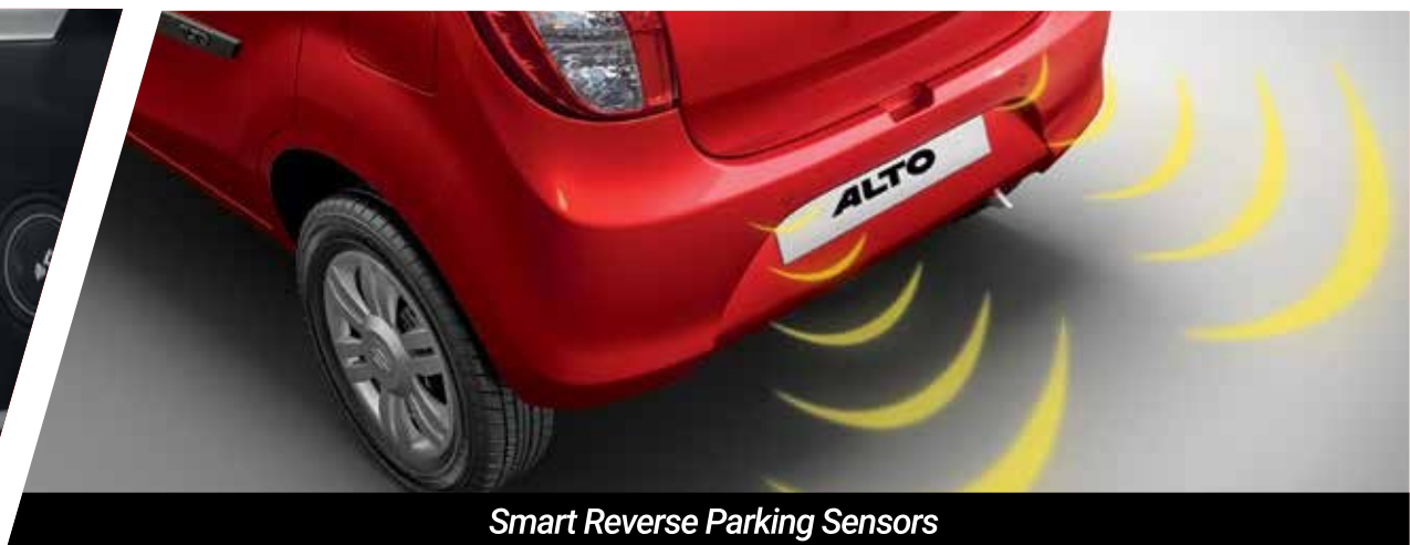
Smart Reverse Parking Sensors