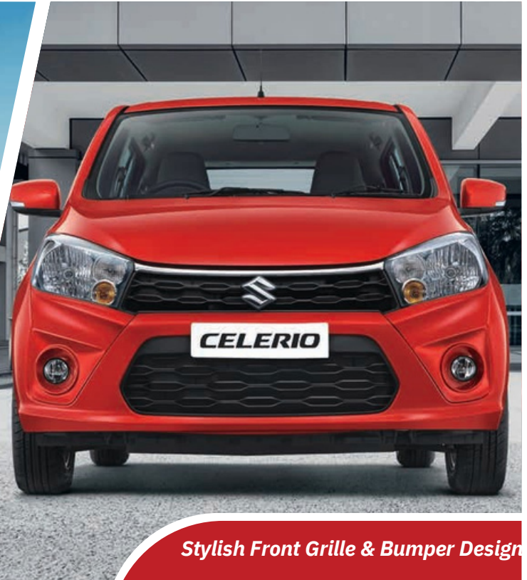
Stylish Front Grille & Bumper Design