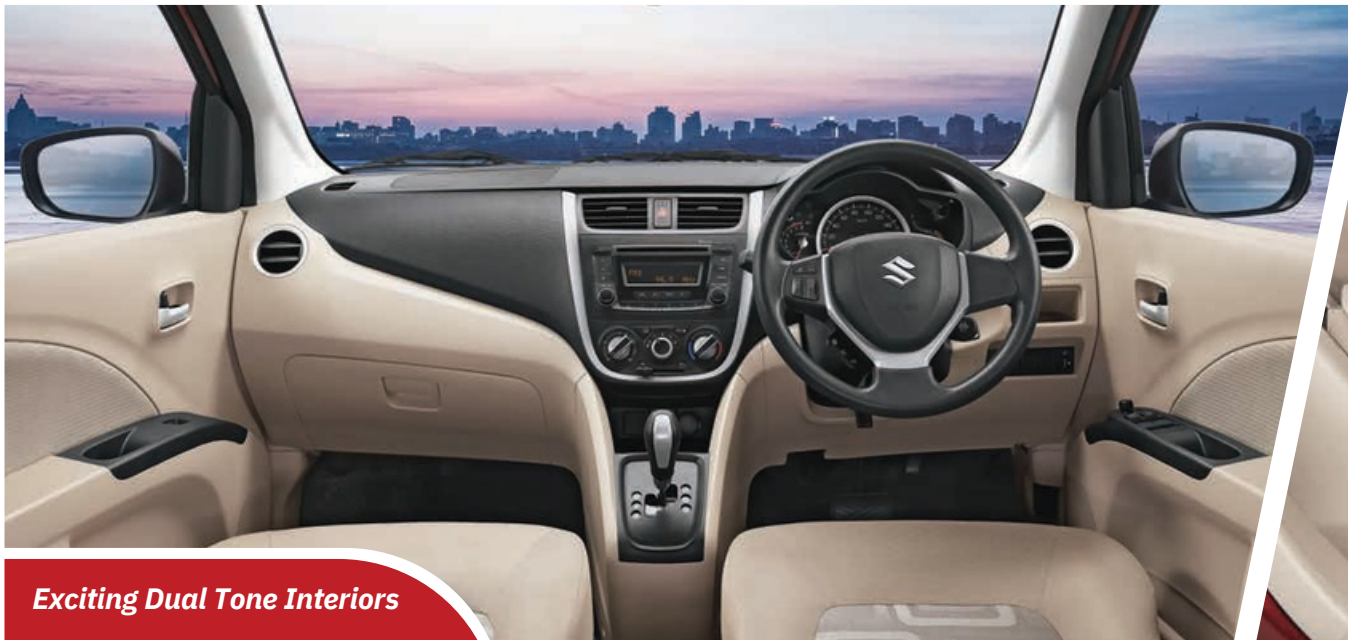
Exciting Dual Tone Interiors