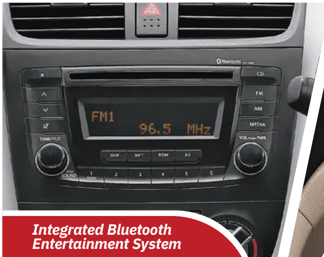
Integrated Bluetooth Entertainment System

AGS Technology, an Integrated Bluetooth Entertainment System and Steering-mounted Audio Controls in the Celerio make driving it just as easy as loving it.