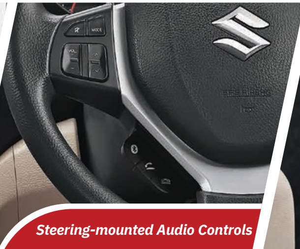
Steering-mounted Audio Controls