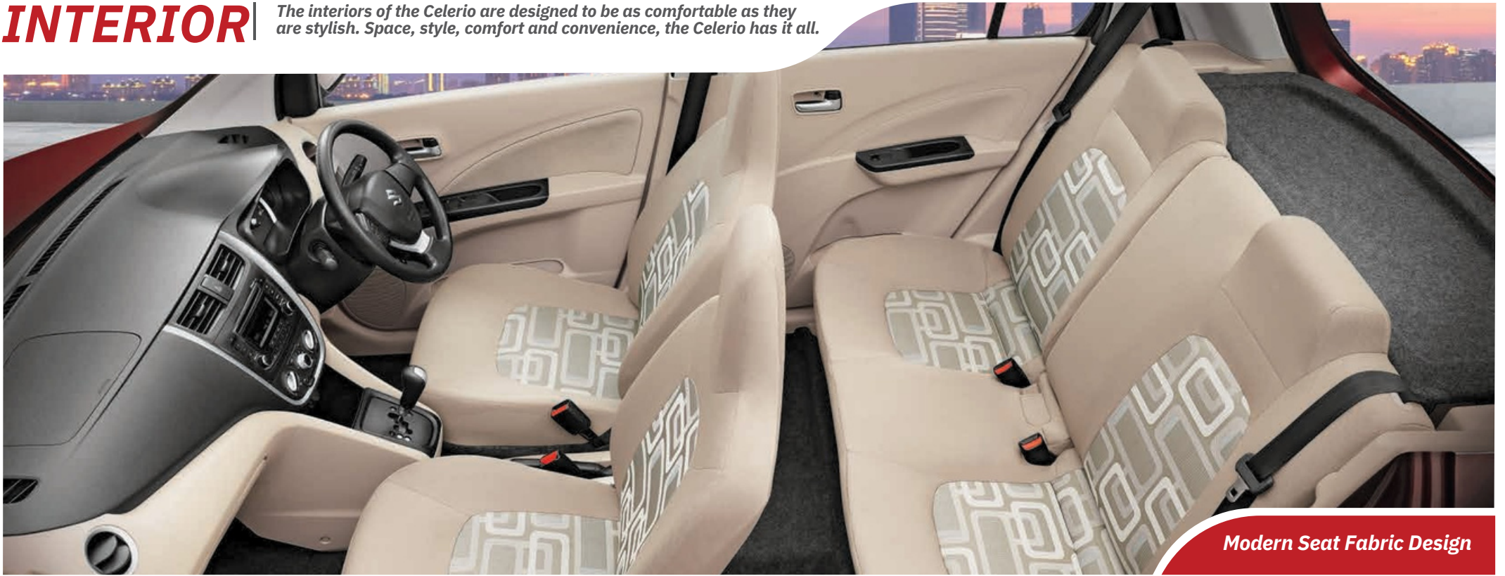
Modern Seat Fabric Design

The interiors of the Celerio are designed to be as comfortable as they are stylish. Space, style, comfort and convenience, the Celerio has it all.