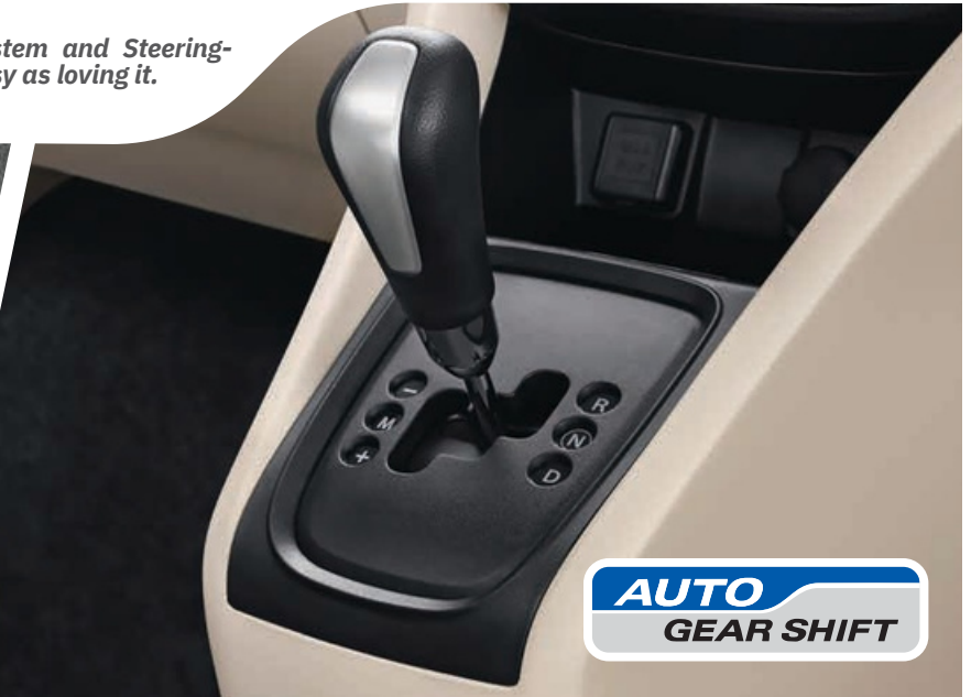
AUTO GEAR SHIFT