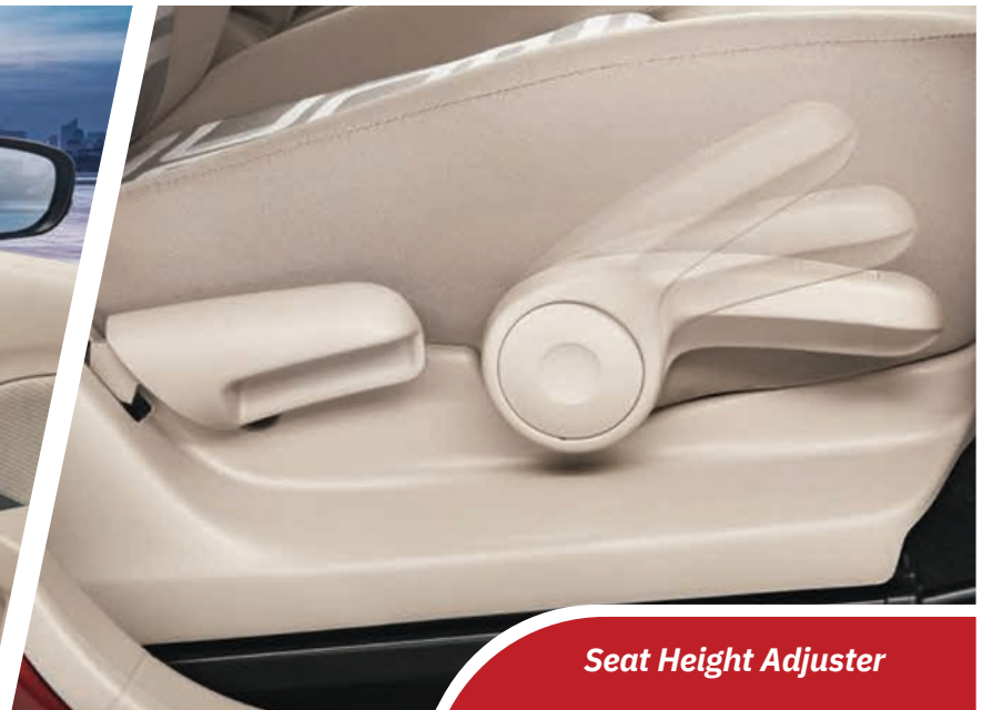
Seat Height Adjuster