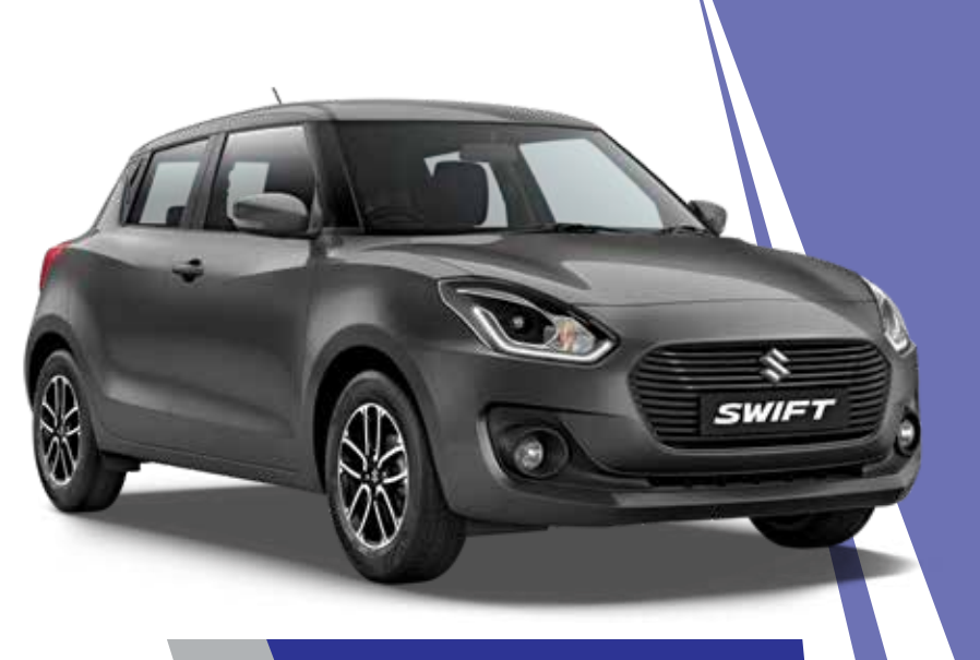
Metallic Magma Grey