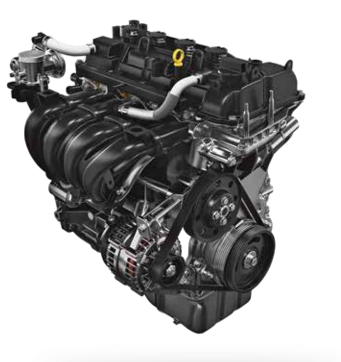
1.2 L VVT Engine

The powerful VVT Petrol Engine in the Swift is engineered to deliver an unmatched driving experience. The performance delivered by the powertrain makes the Swift a machine that's capable of outperforming every challenge, every time.