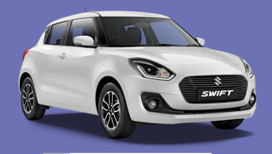
Pearl Arctic White