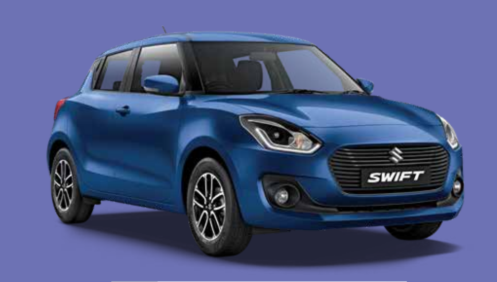
Pearl Metallic Midnight Blue