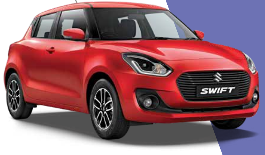
Solid Fire Red