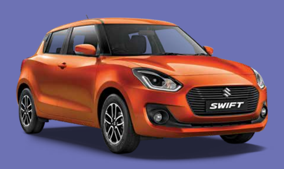
Pearl Metallic Lucent Orange