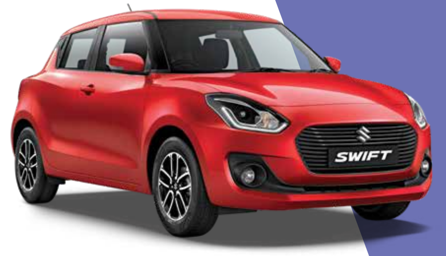
BOLD IN EVERY COLOUR.