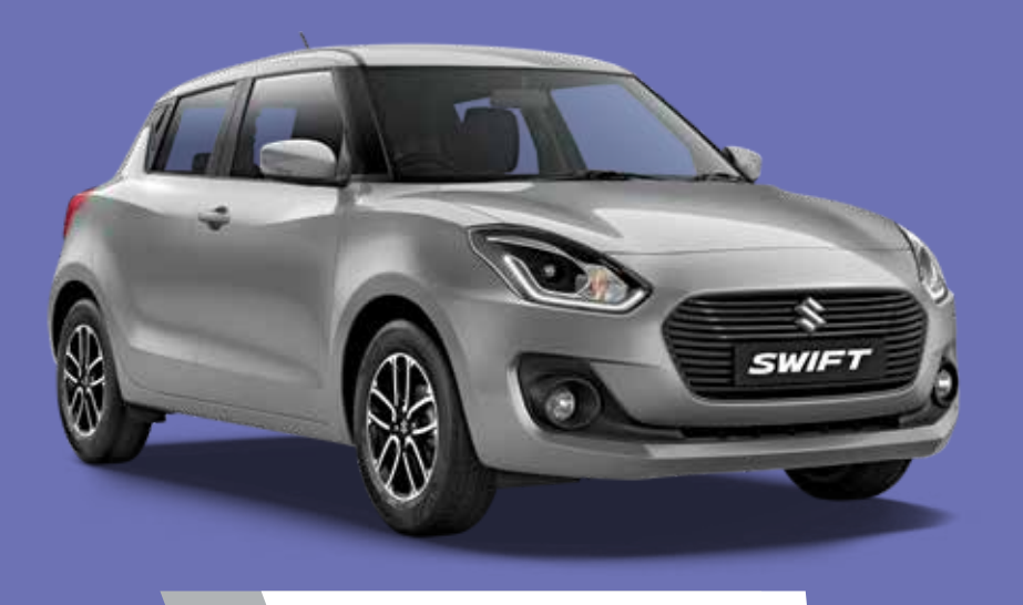
Metallic Silky Silver