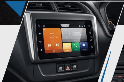
SMARTPLAY STUDIO WITH SMARTPHONE NAVIGATION

The all-new Alto K10 comes with modern interiors with updated technology, a perfect blend of comfort and practicality.