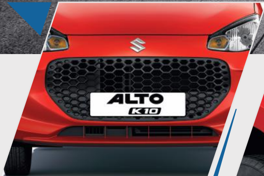
YOUTHFUL CONTEMPORARY DESIGN WITH HONEYCOMB GRILLE

Now experience the feeling of accomplishment with a special companion, the all-new Alto K10. It offers remarkable looks with a great combo of style and modernity.