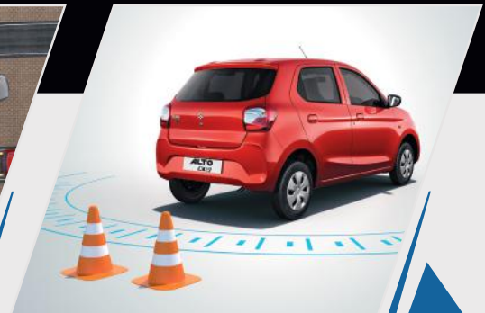
REVERSE PARKING SENSORS