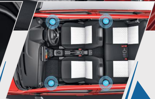
1 st IN SEGMENT 4 SPEAKERS