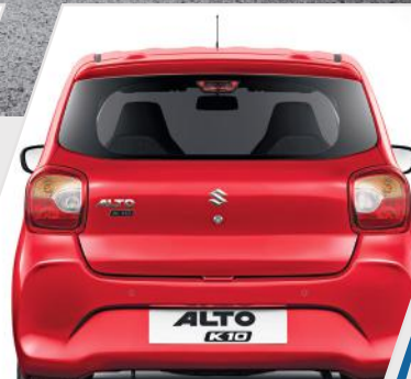
TRENDY REAR COMBINATION LAMPS