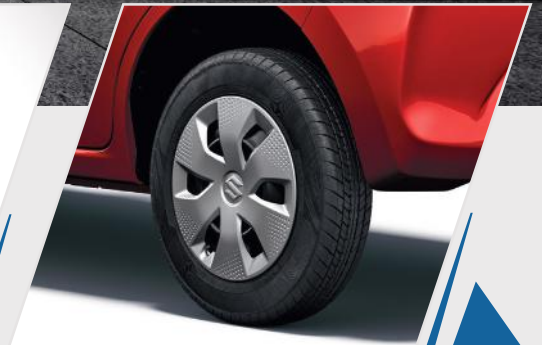
145/80 R13 TYRES WITH HONEYCOMB WHEEL COVERS