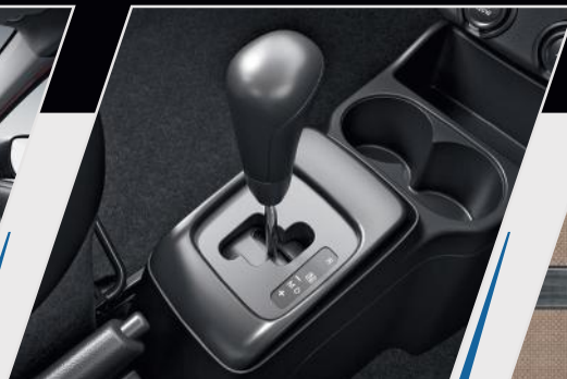
AUTO GEAR SHIFT TECHNOLOGY