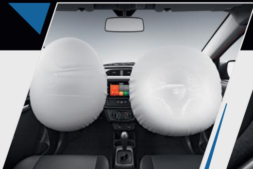
15+ SAFETY FEATURES INCLUDING DUAL AIRBAGS##

NEXT GEN K-SERIES 1.0L DUAL JET, DUAL VVT ENGINE