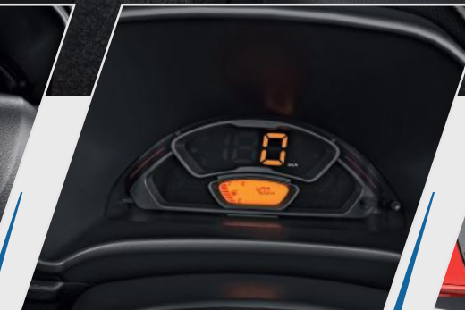
SPEEDO METER WITH EXCITING DIGITAL SPEED DISPLAY