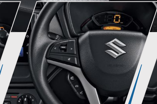
STEERING MOUNTED AUDIO AND VOICE CONTROL