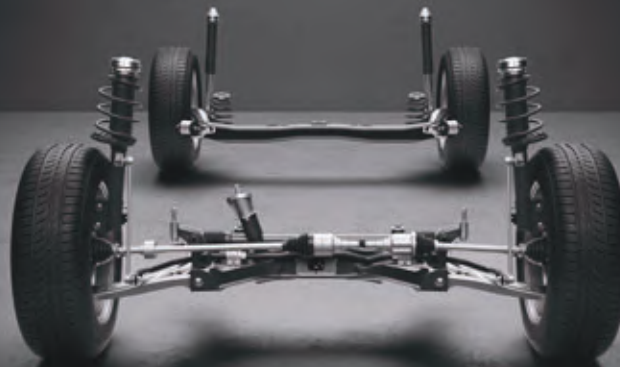
ALL NEW SUSPENSION