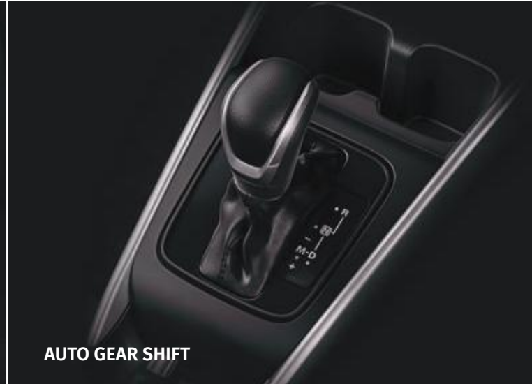
AUTO GEAR SHIFT