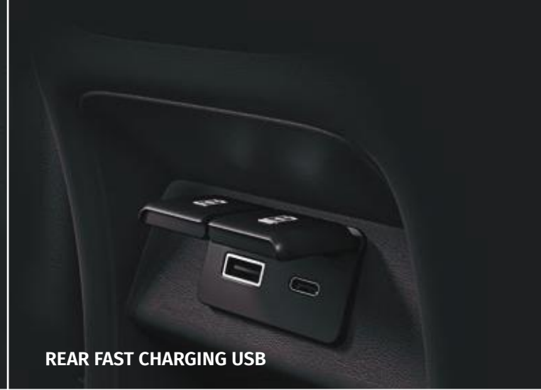
REAR FAST CHARGING USB