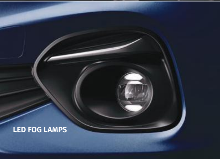
LED FOG LAMPS