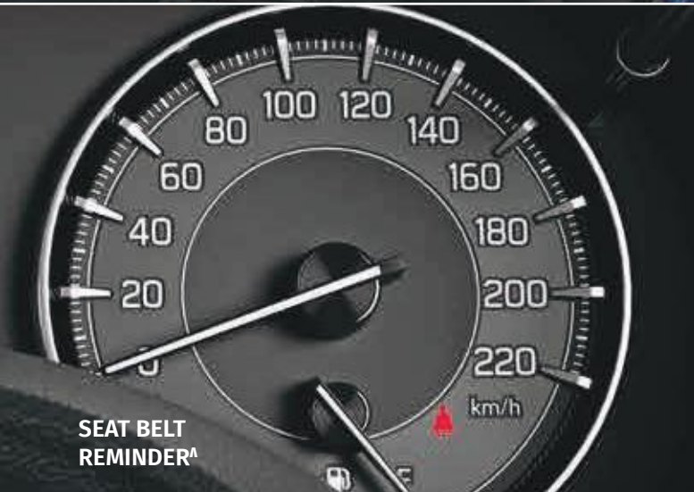
SEAT BELT REMINDER A