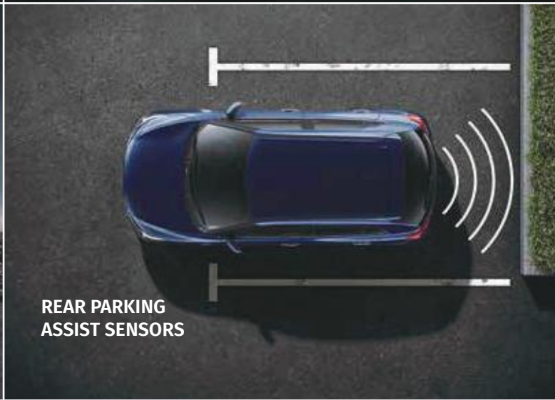
REAR PARKING ASSIST SENSORS