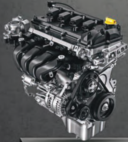
ADVANCED K SERIES DUAL JET, DUAL VVT ENGINE