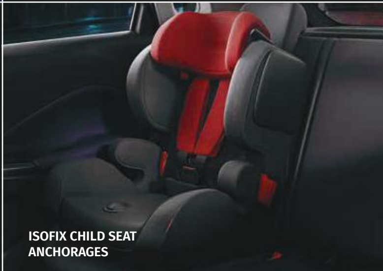
ISOFIX CHILD SEAT ANCHORAGES