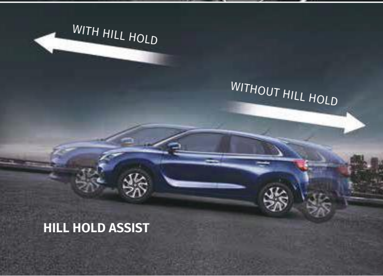
HILL HOLD ASSIST