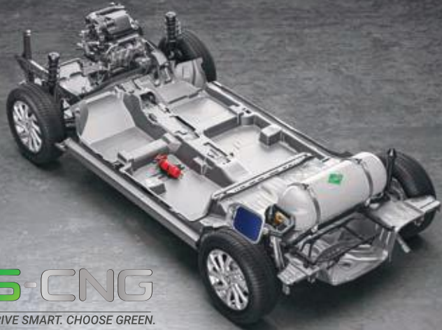
S-CNG DRIVE SMART. CHOOSE GREEN.