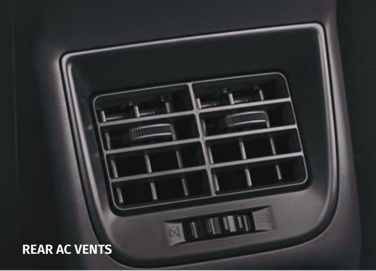
REAR AC VENTS