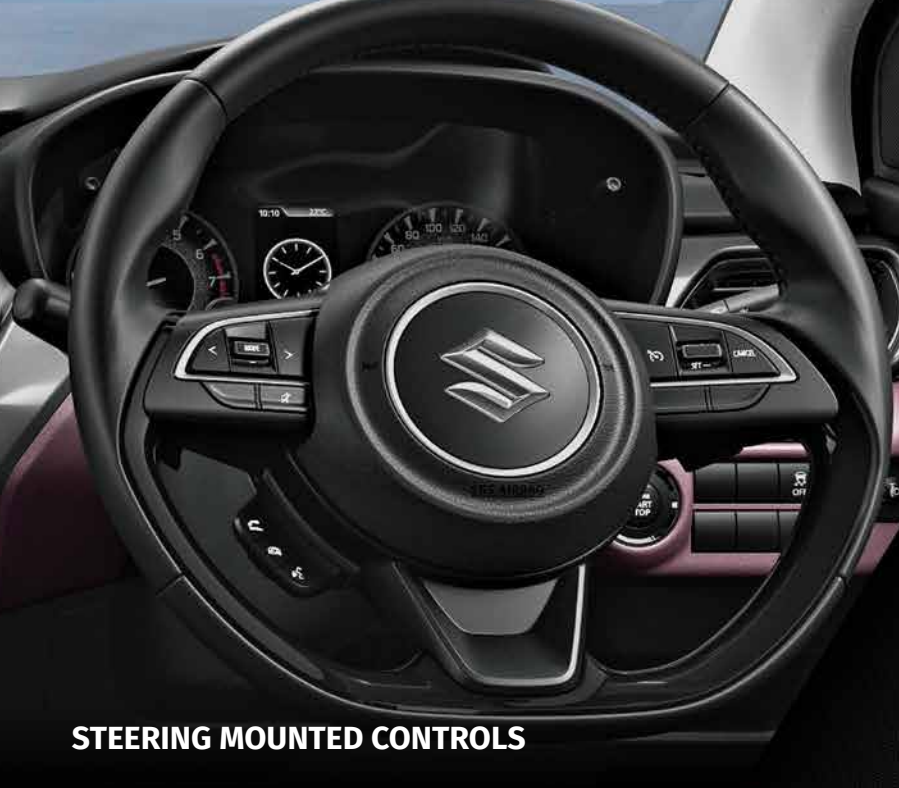
STEERING MOUNTED CONTROLS