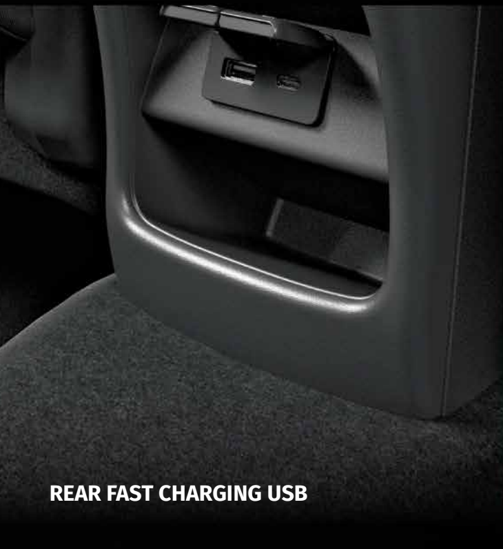
REAR FAST CHARGING USB